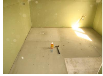
3. fixing down the other flooring boards