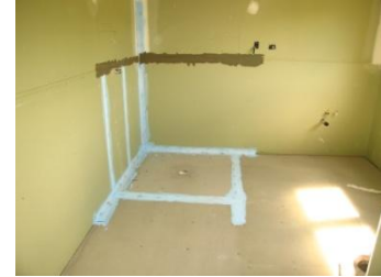
4. waterproofing and reinforcing all joints