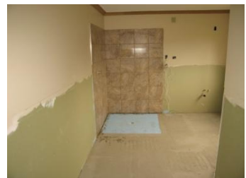
6. Tiling the walls