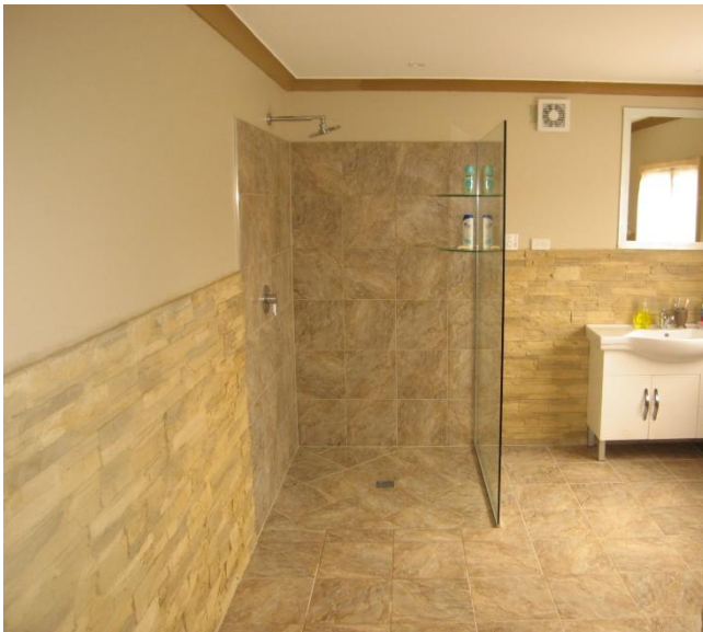
Tiled shower - same level as floor