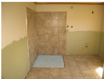
7. Tiling the floor around shower