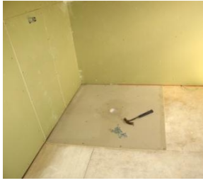
2. fixing down the shower base