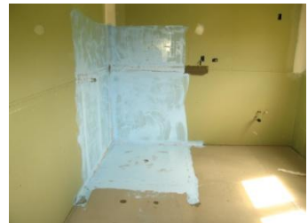
5. waterproofing the shower area