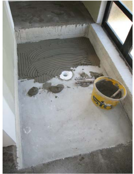
applying flexible tile adhesive onto the concrete