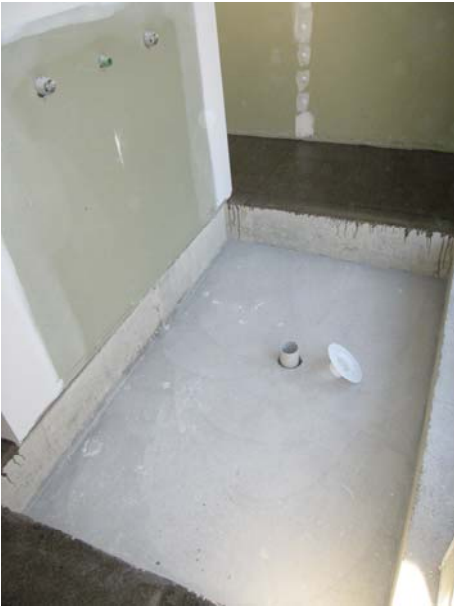
installing the leak control flange