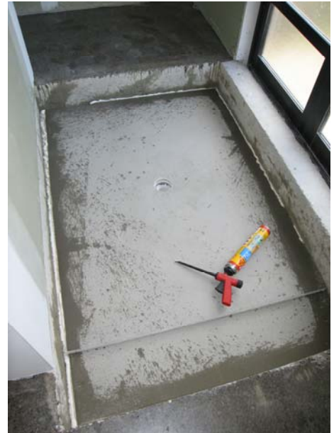
moistening first then closing the gabs with expansion foam