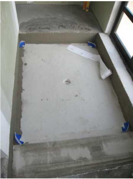
creating little step with 100 mm building board... sealing all corners with corner pieces and tape