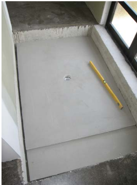
leveling in the base