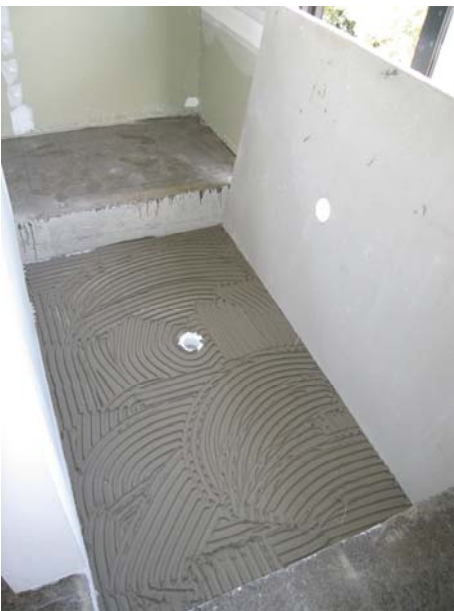
tilting the base down into the bed of adhesive