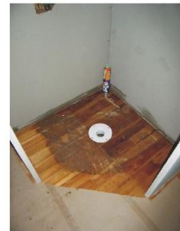
5. Installing leak control flange