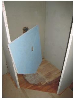
2. Using the shower base as template for waste hole