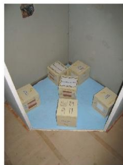
7. Installing shower base and put weight on it for a short time