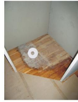
3. Drawing where to cut out hole and reset for leak control flange