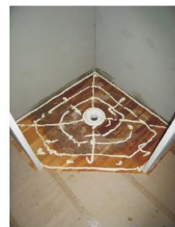
6. Applying special glue onto wooden floor and flange