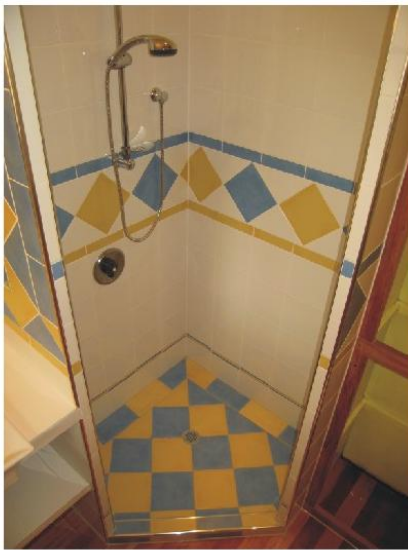
9. Finished tiled shower with up-stand