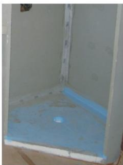
8. Sealing all corners with sealing tape