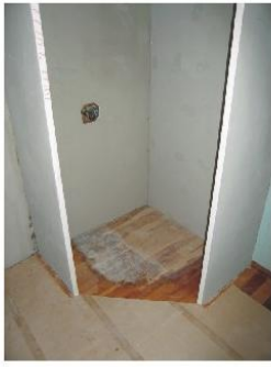
1. Get the wooden floor leveled